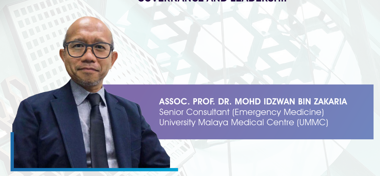
TOPIC 5C: Adverse Events in the Hospital - The Medicolegal Implications

Adverse events in hospitals can have significant medicolegal implications, often leading to legal actions and potential financial repercussions for healthcare institutions. Hospital administrators and healthcare providers may face reputational damage, increased insurance premiums, and potential financial settlements or judgments if found liable. To mitigate medicolegal risks, hospitals have implemented good governance strategies like improved patient safety protocols, incident management system, risk management strategies, quality improvement and enhanced communication among healthcare teams. In addition, the use of electronic health records and technology-enabled safety checks has been encouraged to reduce errors and improve documentation.